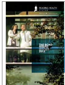
2013 THE ROAD AHEAD