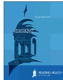
2012 ADVANCING HEALTH, TRANSFORMING LIVES