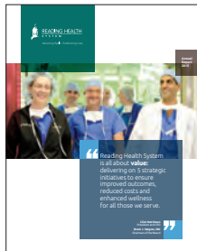
2015 DELIVERING VALUE