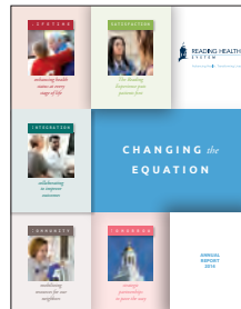
2014 CHANGING THE EQUATION