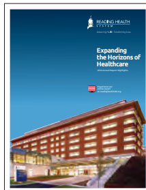
2016 EXPANDING THE HORIZONS OF HEALTHCARE

http://ReadingHealthAR.langtoncreative.com